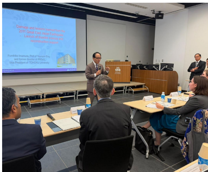
Presentation by Tohoku University's International Research Institute of Disaster Science, Sendai.

The premise of these questions is admittedly abstract, and the answers are not 100 percent clear. However, part of the answer falls directly within the remit and mission of the Uehiro-Carnegie Endowment for Future Generations and should continue shaping future programming.