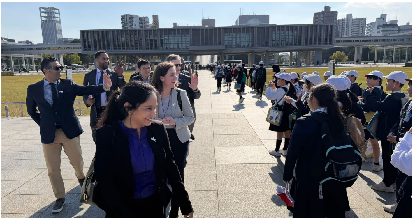
Delegation greets Japanese school children on field trips to Hiroshima, part of their curriculum called Kokoro-no-kyoiku .

The IRIDeS researchers also emphasized the importance of international cooperation and knowledge sharing. In 2013, IRIDeS partnered with the Association of Pacific Rim Universities (APRU) , a network of 61 leading universities, to create the APRU-IRIDeS Multi-Hazards Program . This program supports research, an annual symposium, and an annual summer school. In