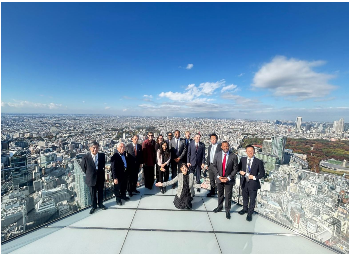
Visit to Tokyu Corporation, Shibuya Sky.

And really this dual consciousness—clear-eyed about the past, ambitious and hopeful about the future—surfaced everywhere we went.