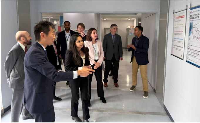
Visit to Center for iPS Cell Research and Application, Kyoto University.

system, an ecosystem, a “crossing,” that is being built with them in mind; a legacy that will come to existence post a chairman of the board being alive to see it—his children being alive to see it—and perhaps even their children. Is that what it means to dream in Japan? Is that what it means to have a legacy? To create and work on something that no one will remember you for because it is so many years in the future . . . something that requires partnerships spanning lifetimes while working to provide solutions to problems that have not yet been experienced?