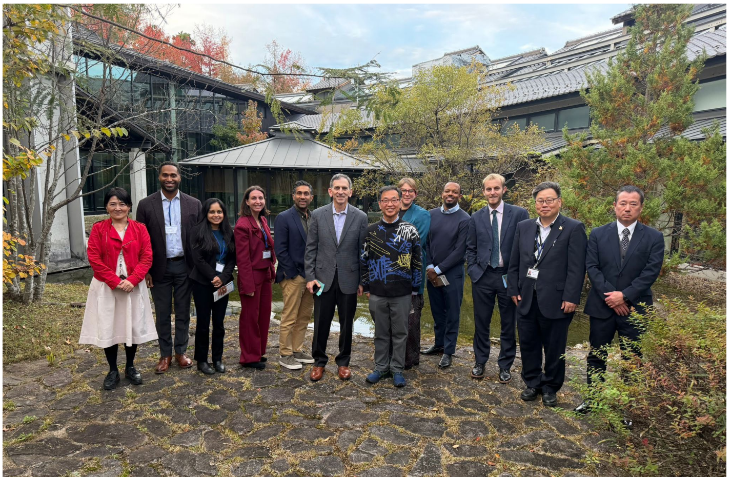
Visit to Research Institute for Humanity and Nature, Kyoto.

driven by a sense of perceived power over nature, as a resource to control. This lack of regard has long-term consequences: Extreme weather events have become more commonplace, survival rates have lowered for many species of plants and animals, and an increasing number of people have become displaced from their homes. Addressing the climate crisis requires, in my mind, a fundamental rethinking of humanity's relationship with nature and working toward a more balanced relationship between the two.