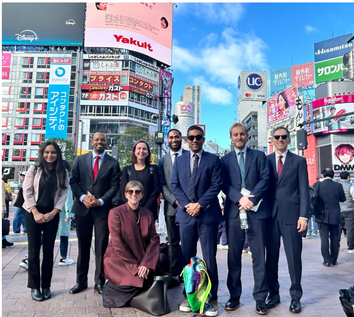
Uehiro-Carnegie Endowment for Future Generations Study Tour Delegation in Shibuya Scramble Crossing.

Before leaving New York, two delegates asked me the same question: What would success look like from the week-long visit?