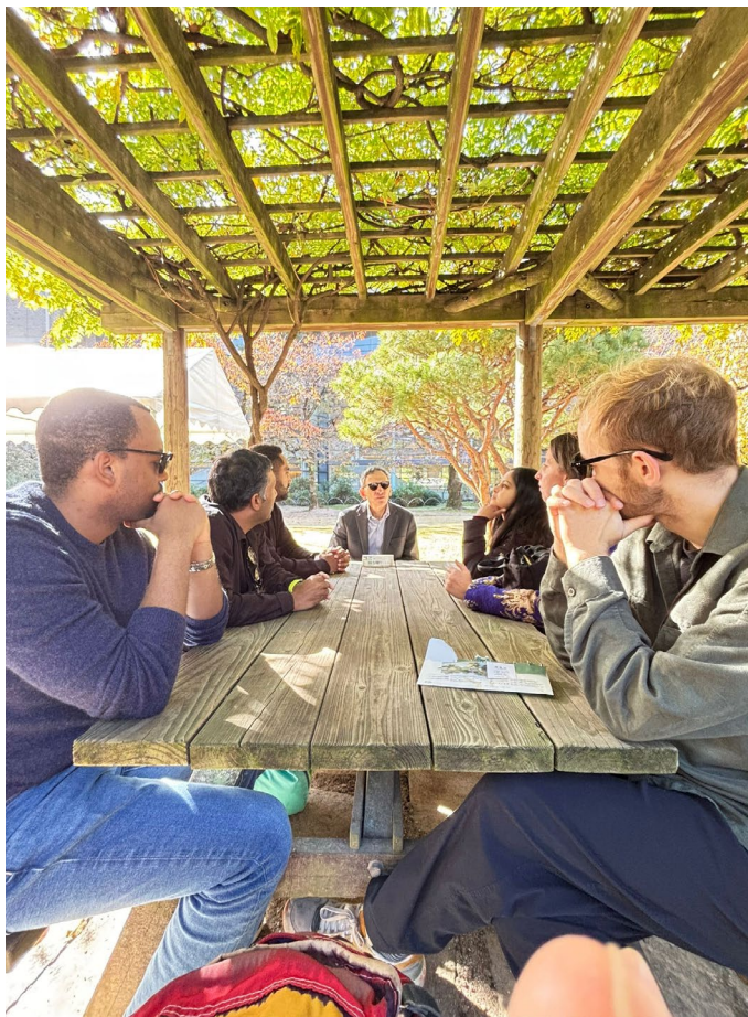
Uehiro-Carnegie Endowment for Future Generations Study Tour Delegation reflection session in Shukkeien Garden, Hiroshima.

Pragmatic policymaking is often misunderstood as technocratic or value neutral. Our study tour of Japan challenged that assumption. What I encountered instead was a model of policymaking that is deeply ethical, resolutely forward-looking, and grounded in realism rather than ideology. Japan's approach across urban planning, disaster preparedness, memory-keeping, and international engagement demonstrates how ethics and pragmatism can reinforce one another, offering important lessons for policymaking in an increasingly fractured world.