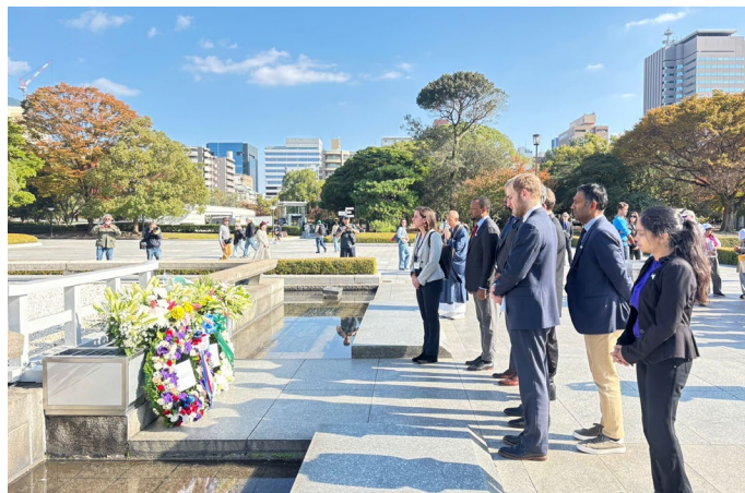
Delegation lays wreath at Atomic Bomb Memorial, Hiroshima.

While in Hiroshima, we visited the Hiroshima Peace Memorial Museum . At the museum, I stopped to reflect on the images of people affected by the atomic bomb and closely listened to our tour guide who was explaining the images and giving us more context. A few moments later, I noticed many young school children walking around the museum, looking like they may be on a field trip. Later that day, I found out that they were indeed on field trips from multiple schools to learn about peace studies, which was part of their curriculum in which they learned about what happened during World War II and the importance of peace. Elementary and junior high schools in Japan have a nationally mandated curriculum called Kokoro-no-kyoiku , which translates to “education of the heart.” This part of the curriculum includes lessons on peaceful resolution and a visit to the Hiroshima Peace Memorial Museum.